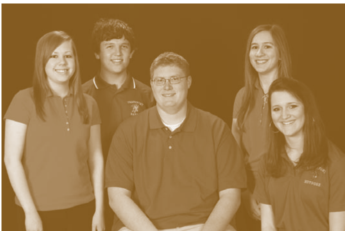
2011 Lilly Endowment Community Scholarship Finalists